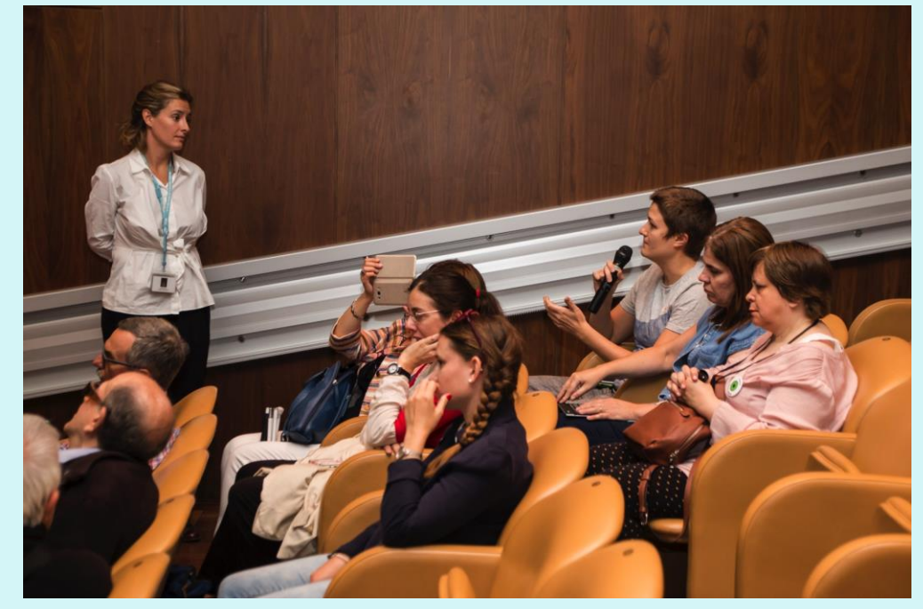
One member of the audience asks a question during the presentation in Madrid.