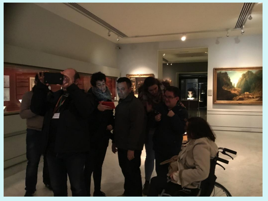
A group of participants tests an app at the Lázaro Galdiano Museum