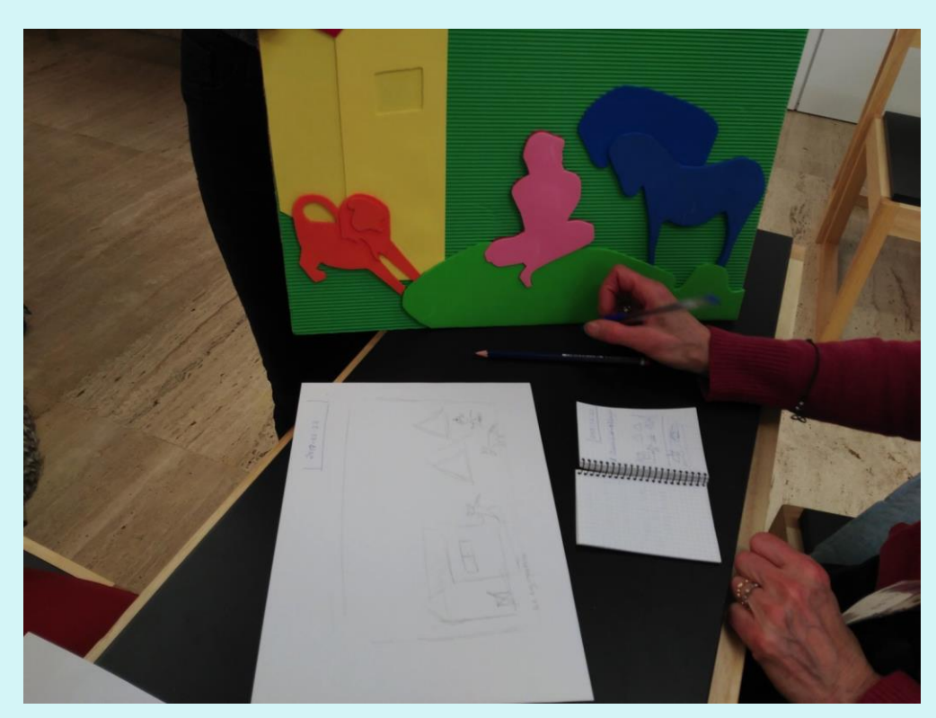
Materials used for the audiodescription activity: black paper, tactile image and blooklet for notes.