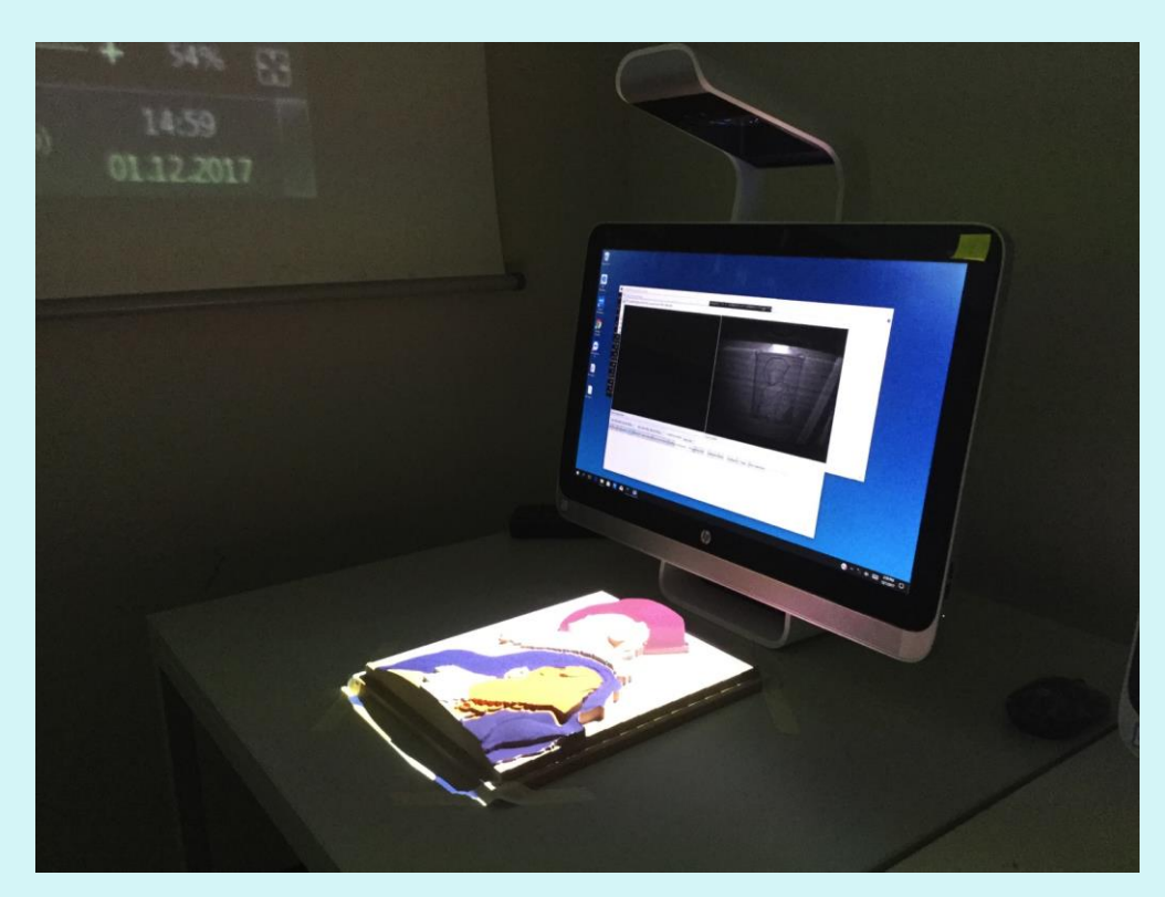
The sprout colours the different sections of a reliefs and identifyes the hand movement.