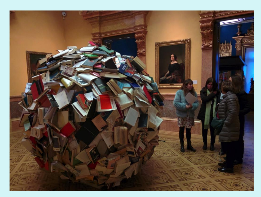
An educator audiodescribes an artwork to a group pf participants at Lázaro Galdiano Museum