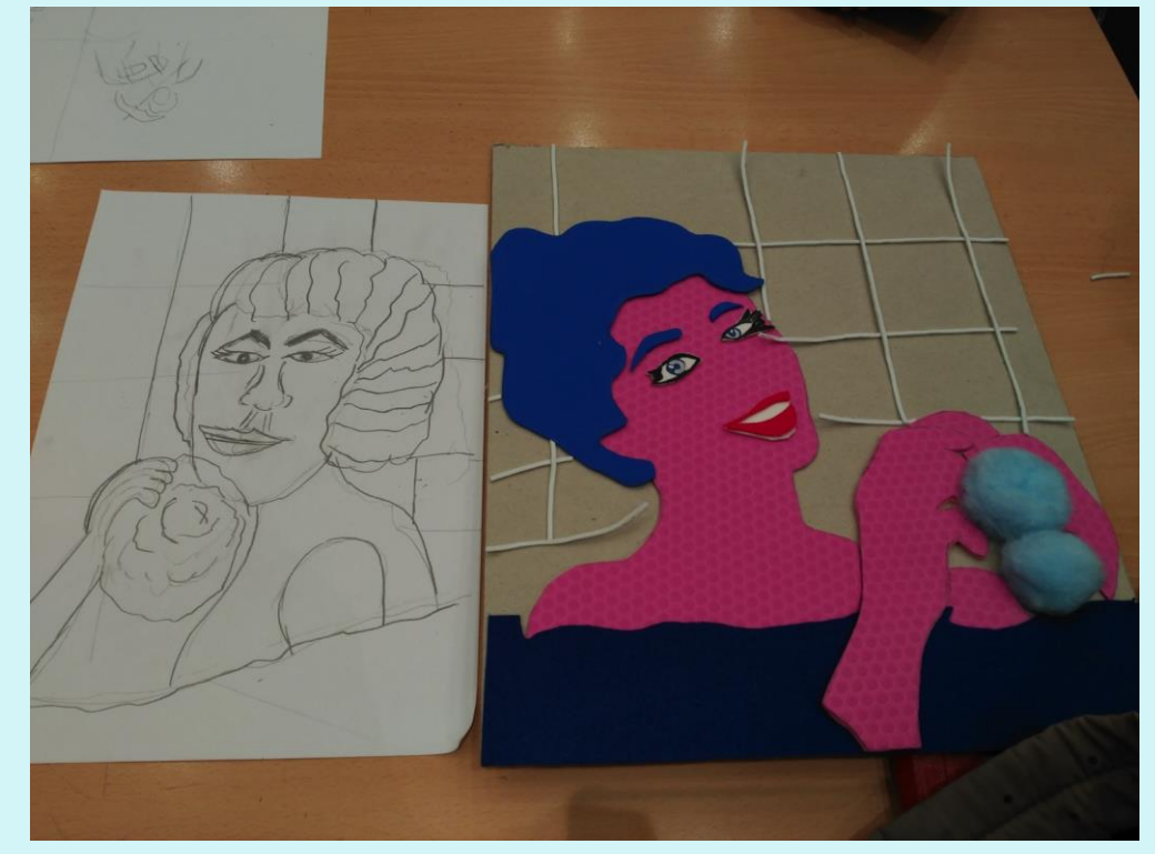
Comparison between the tactile image and the drawing resulted from audiodescribing it.